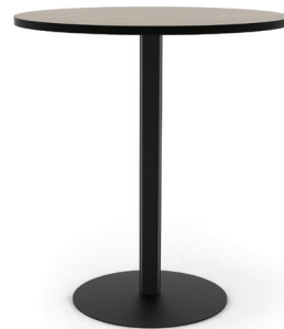
Bar Height with Cast Iron Disc Base*