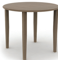
Wood Legs Attached with Steel Plate***