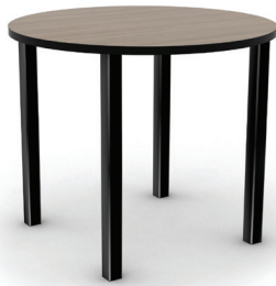
Black Metal Legs*