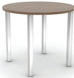
Silver Metal Legs*

Standard edge color is black 3mm flat PVC, center pedestal tables are available with 3mm flat PVC edge or double contour edge. Contact your rep for available color match edge options.