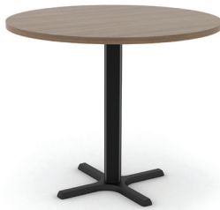
Cast Iron Pedestal Base*