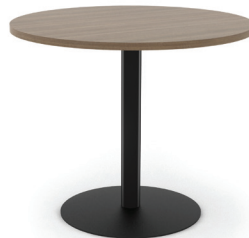
Cast Iron Disc Base*