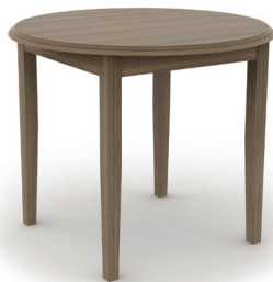
Wood Legs with Apron shown with Double Contour Wood Edge**

Standard edge color is black 3mm flat PVC, center pedestal tables are available with 3mm flat PVC edge or double contour edge. Contact your rep for available color match edge options.